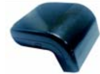
Integrated GSP receiver