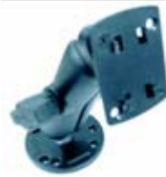
Vehicle Mount (option : suction type or screw type)