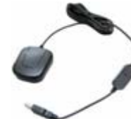
External GPS receiver