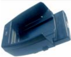
Cradle Main Body