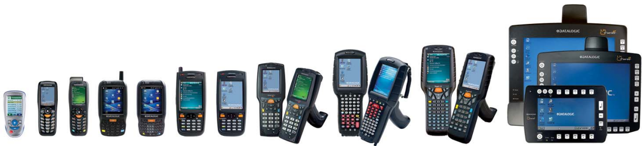
Datalogic Mobile has a complete line of rugged mobile computers for retail, warehouse and field force applications.

Our diverse product range of rugged mobile computers includes pocket-sized computers, pistol grip mobile computers, and industrial PDAs designed to keep workers connected to their enterprise inside or outside the four walls. Our mobile computers use Cisco® Certified CCX radios for maximum levels of: RF security, data throughput, and efficiency. Datalogic Mobile computers use the latest technologies for voice and data communications giving mobile workers on-the-go connectivity.